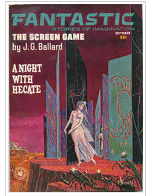
In 1963, another Emshwiller cover illustrated the Vermilion Sands story "The Screen Game"