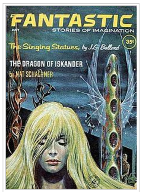
Ballard's Vermilion Sands story "The Singing Statues" was omitted from the first American editions