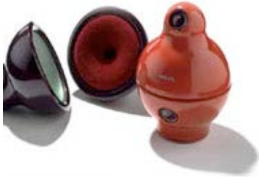
Figure 3. Concept from Philips' vision of the future project.

extensible, as numerous undergraduate and graduate programs in interaction design have imitated the project.